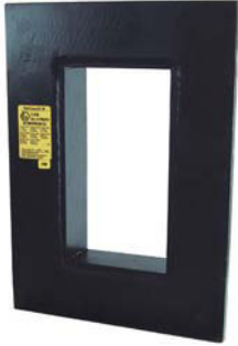
SF 6x1 W Ex primed EXSFF6000000112

Cadres SF...W Ex , acier doux peint ▶ SF...W Ex Rahmen, Baustahl geprimert ▶ Marcos SF...W Ex en acero dulce imprimado ▶ Telaio SF...W Ex, in acciaio con prima mano d'antiruggine