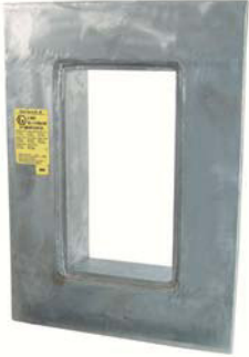
SF 6x1 W Ex AISI 316 EXSFF6000000121

Cadres SF...W Ex, acier inox résistant aux acides » SF...W Ex Rahmen, säurefester, rostfreier Edelstahl » Marcos SF...W Ex en acero inoxidable a prueba de ácidos » Telaio SF...W Ex, in acciaio inox resistente agli acidi